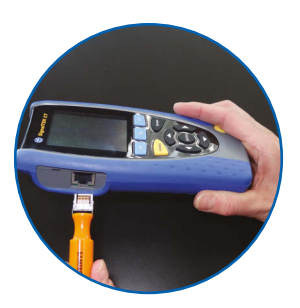
Replaceable RJ45 contacts