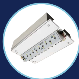
Retro-fit Gear Tray