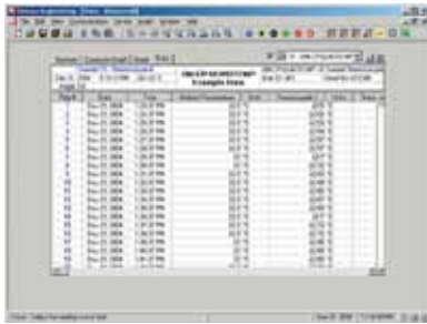
OM-CP-IFC200, Windows software displays data in graphical or tabular format.