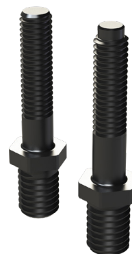
comparison between NRIV-GM (left) and NB-GM (right)