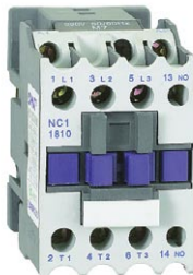
NC1 D18 10