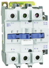
NC1 D50 11