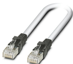
Patch cable, CAT5, assembled, 10 m

https://www.phoenixcontact.com/za/products/2832629