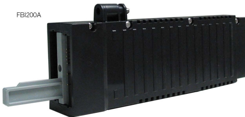
FBI200A Mounting Adapter