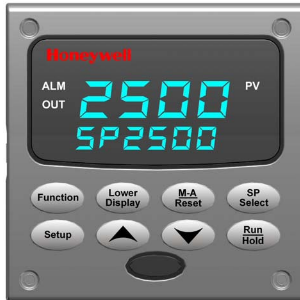
Figure 1 Front of UDC2500

The UDC2500 provides a ¼ DIN sized alternative for many applications. Its features include: Universal AC power supply, optional RS422/485 Modbus® RTU or Ethernet 10Base-T TCP/IP communication protocols, input/output isolation, Isolated Auxiliary Current output.