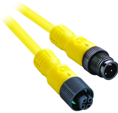
4-pin DC Micro Cordset