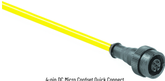
4-pin DC Micro Cordset Quick Connect