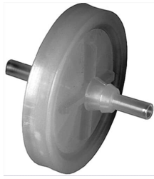
ABB Automation GmbH 8018512