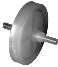
ABB Automation GmbH 00000000000018512