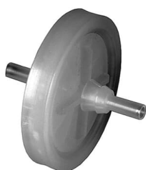
ABB Automation GmbH 00000000000018512